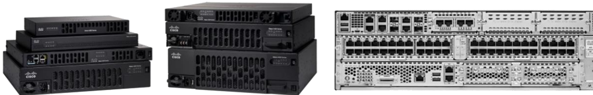
Figure 1. Cisco 4000 Series Integrated Services Routers

The ISR 4000 Series contains the following platforms: the 4461, 4451, 4431, 4351, 4331, 4321, and 4221 ISRs.