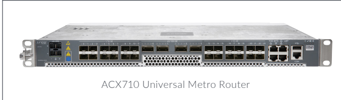
ACX710 Universal Metro Router