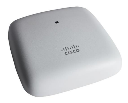
Figure 1. Cisco Aironet 1815i Access Point

The 1815i extends support to a new generation of Wi-Fi clients, such as smartphones, tablets, and high-performance laptops that have integrated 802.11ac Wave 1 or Wave 2 support.