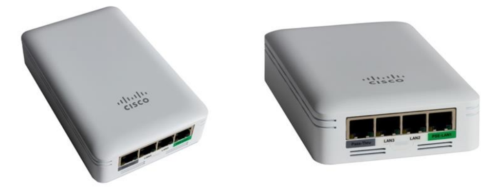
Figure 1. Cisco Aironet 1815w Access Point

Packing 802.11ac Wave 2 wireless support and Gigabit Ethernet wired connectivity into a sleek device, the 1815w is built to take full advantage of existing cabling infrastructure while blending into the visual footprint. This combination provides best-in-class performance while reducing total cost of ownership.