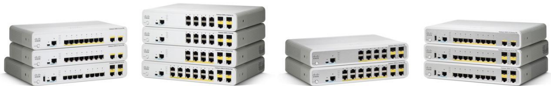
Cisco Catalyst 2960-C Series Compact Switches