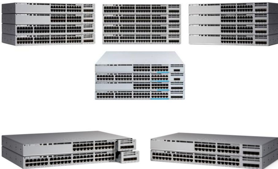
Figure 1. Cisco Catalyst 9200 Series switches

The Cisco Catalyst 9200 Series is made up of modular (C9200) and fixed (C9200L) switch models.