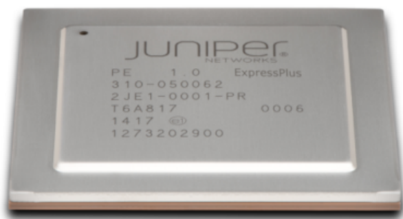
Figure 1: The custom-built Juniper Q5 ASIC

The QFX10002 switches are built with Juniper custom Q5 ASICs, which offer industry-leading performance and scale with 1 Tbps of switching throughput and support for network virtualization with VXLAN, Ethernet VPN (EVPN), and MPLS. The Q5 ASIC is embedded with on-chip analytics capabilities, along with Precision Timing Protocol and high-frequency monitoring.