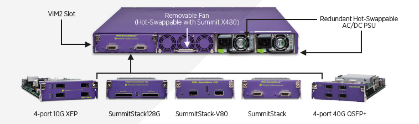
Figure 3: SummitStack Stacking Architecture